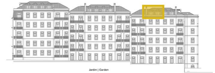
Jardim | Garden